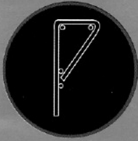
Standard Fold Detail (top & bottom)